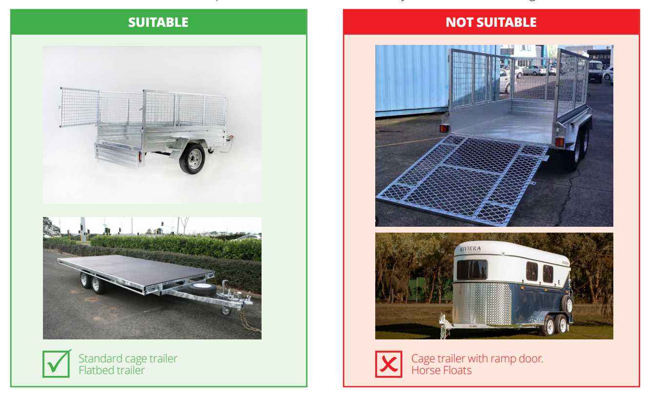
Please take the time to inspect your products upon receiving your delivery.

Cage trailers and trailers that have ramps, need to open like a normal door, not lift down to the ground, forklift needs to get to the back of the trailer without any obstacles. The item needs to be able to sit on top of the sides of the trailer or easily fit inside not on an angle.